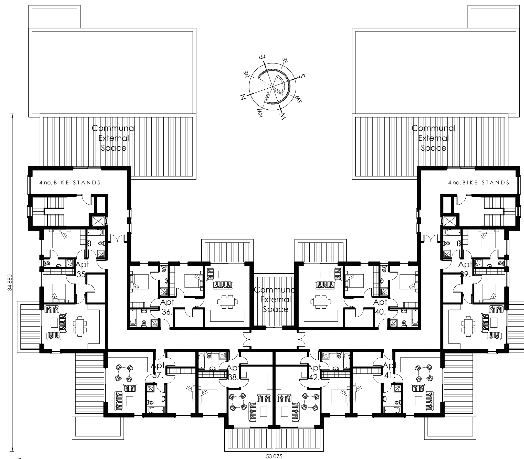
Third Floor Plan Scale 1:200