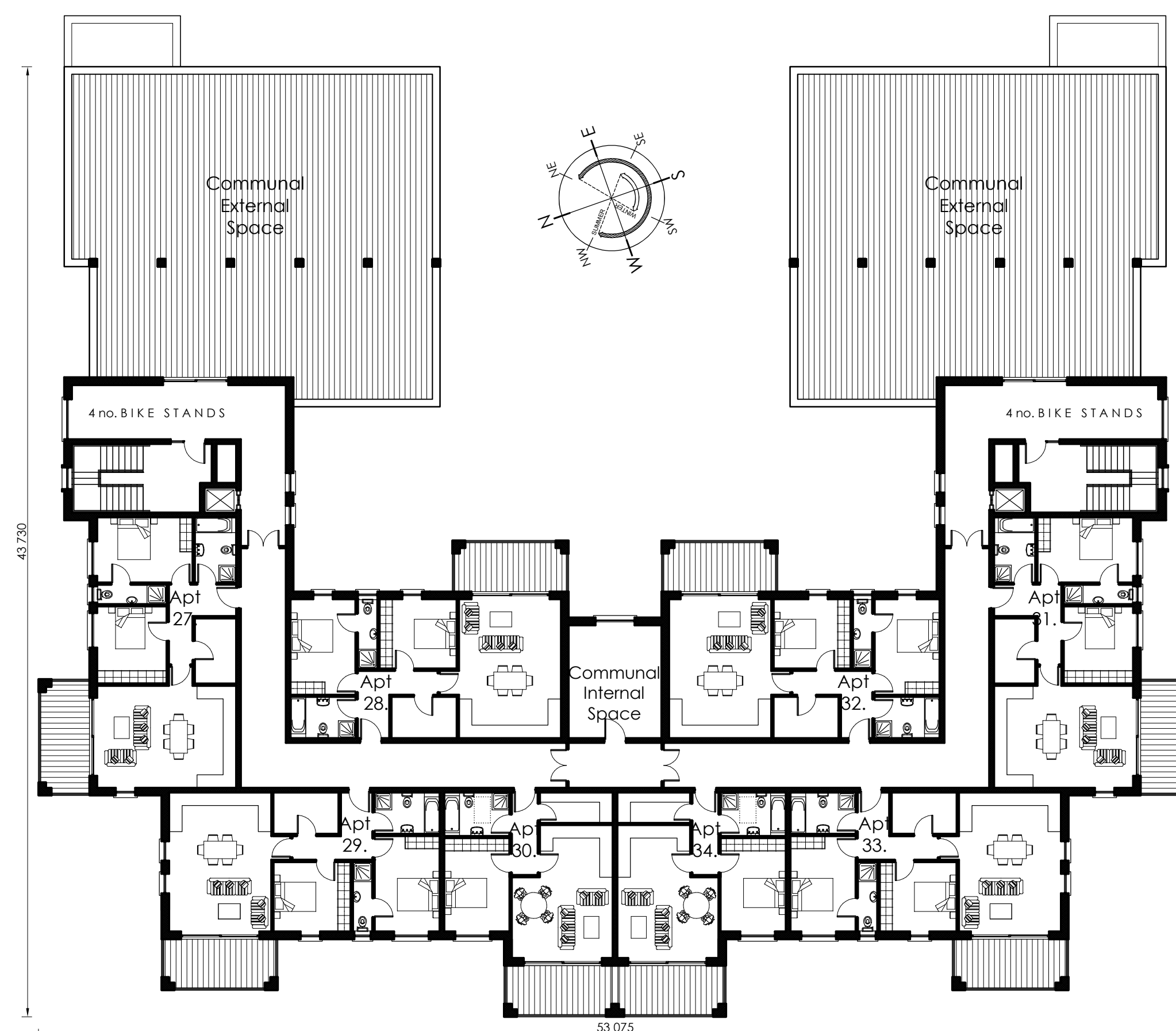
Second Floor Plan Scale 1:200